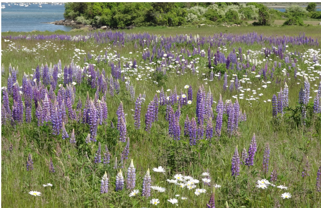
Lupins on conserved land