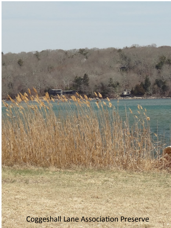
Coggeshall Lane Association Preserve

A fund restricted to maintenance of coastal dune areas owned by the Town of Westport through planting, fertilizing, anti-erosion barriers, and placement and maintenance of signs.