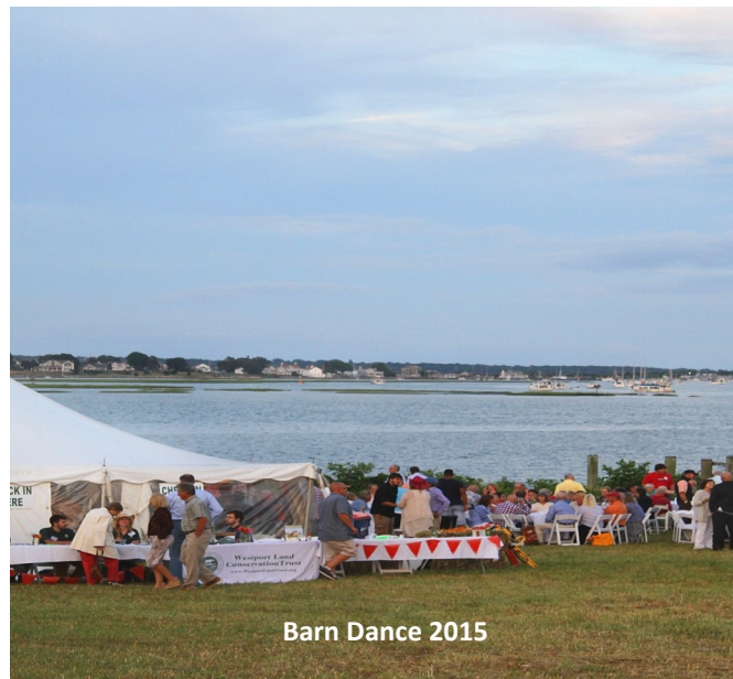
Barn Dance 2015