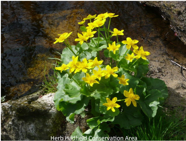
Herb Hadfield Conservation Area

President's Letter Board of Directors and Staff WLCT Operating Income and Expenses Restricted Funds Balances 2015 Donors Land Conservation Map