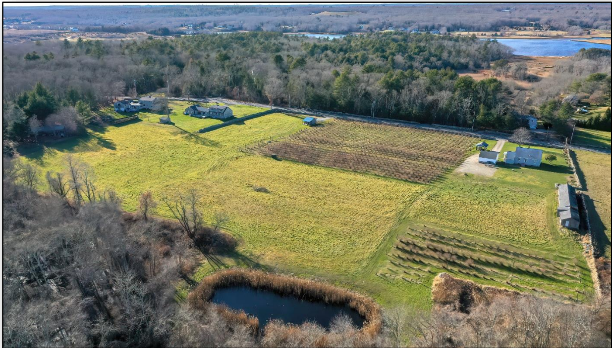
Berry Hill Farm, a 2022 WLCT Land Preservation Project